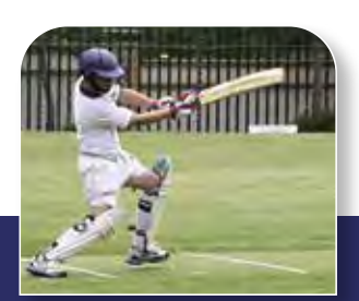
CRICKET | SOCCER